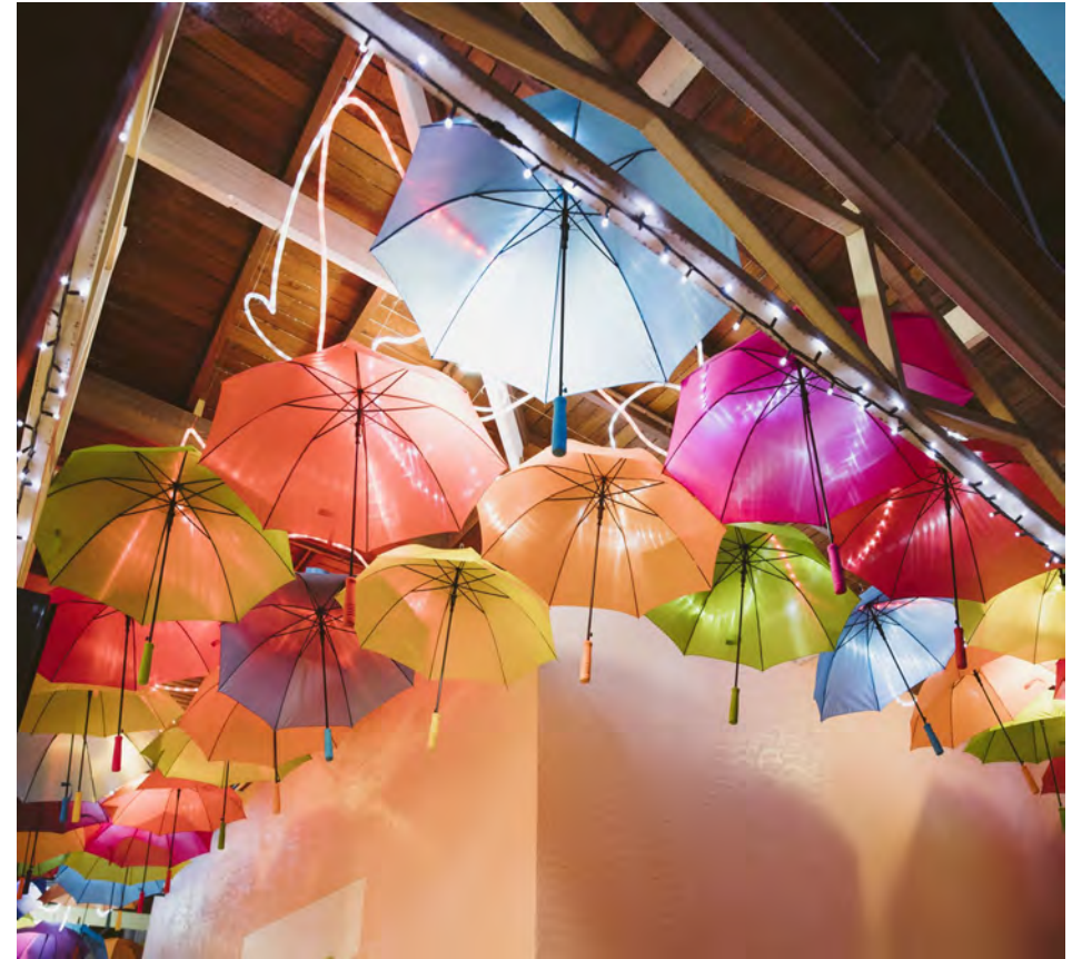
BRAG Courtyard