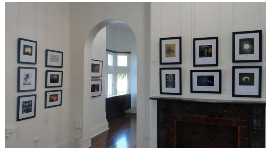
BRAG Convent Gallery

Two large windows admit natural daylight, and are equipped with dimming (not black out) roller blinds which can be drawn if required.