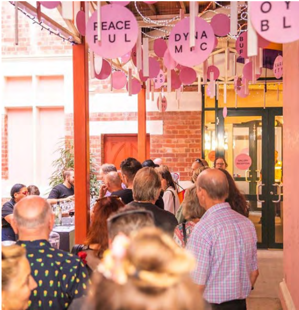
SW Art Now 2018 Opening Night