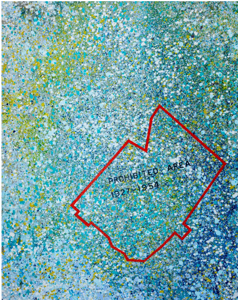
Image: Rohin Kickett (Dushong), Prohibited Area , 2019 Acrylic on canvas.

Entries Open 20 th February – Close 31 st March 2021