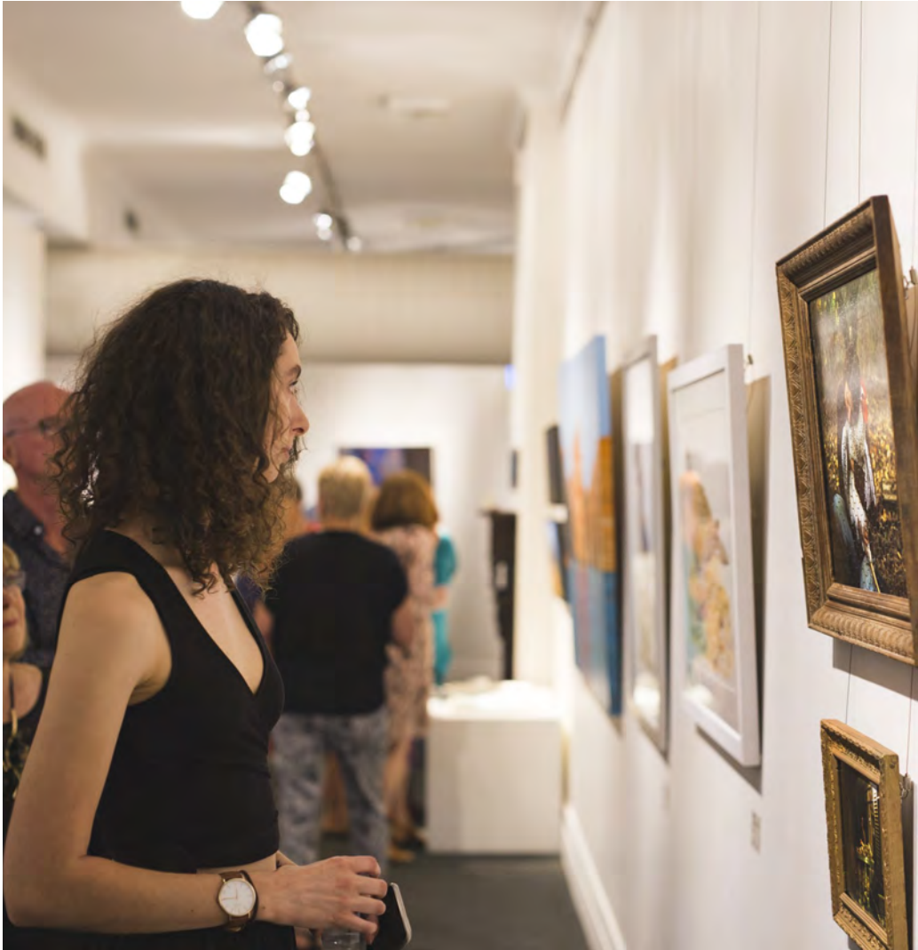
SW Art Now 2018 Opening Night, photographed by Taj Kempe

Works in all mediums will be considered, however the Convent Gallery has limited suitability for audio-visual work. Two-dimensional works are encouraged to use the Gallery hanging system.