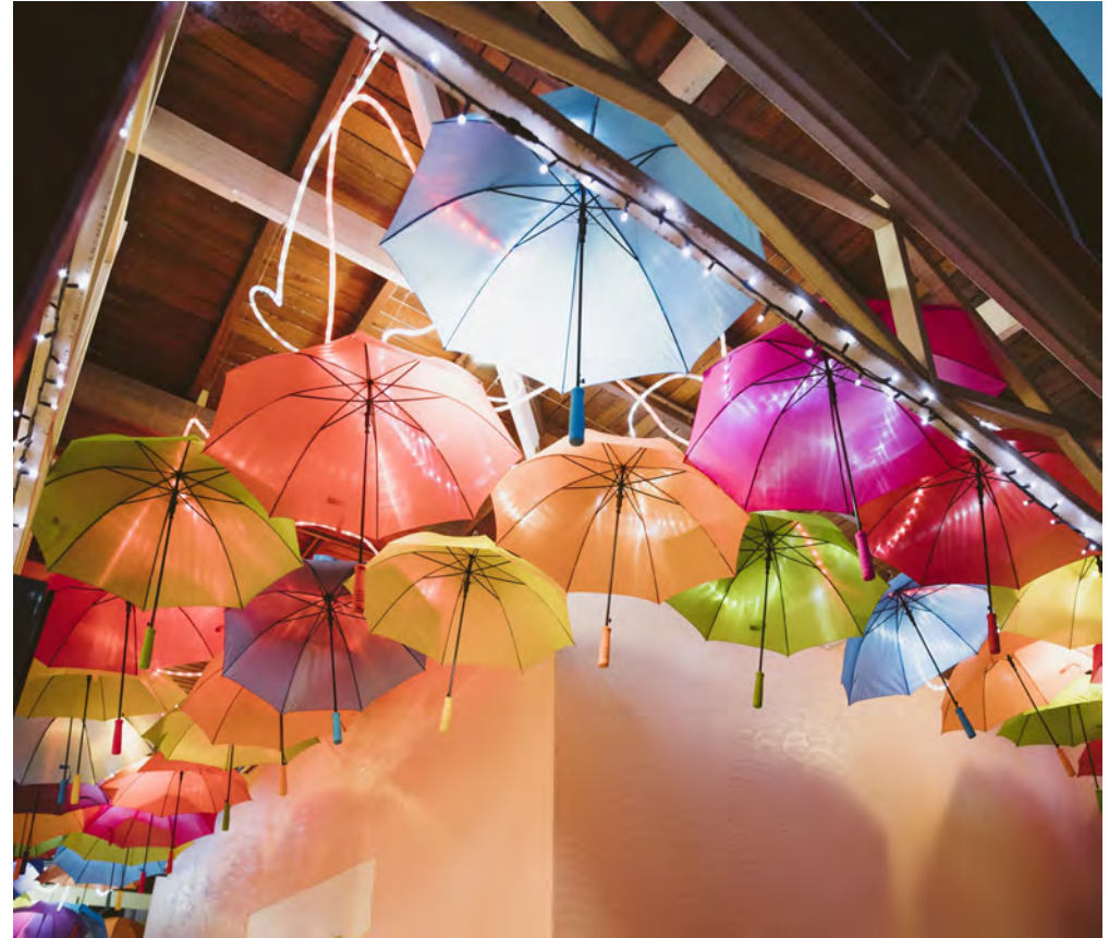
BRAG Courtyard